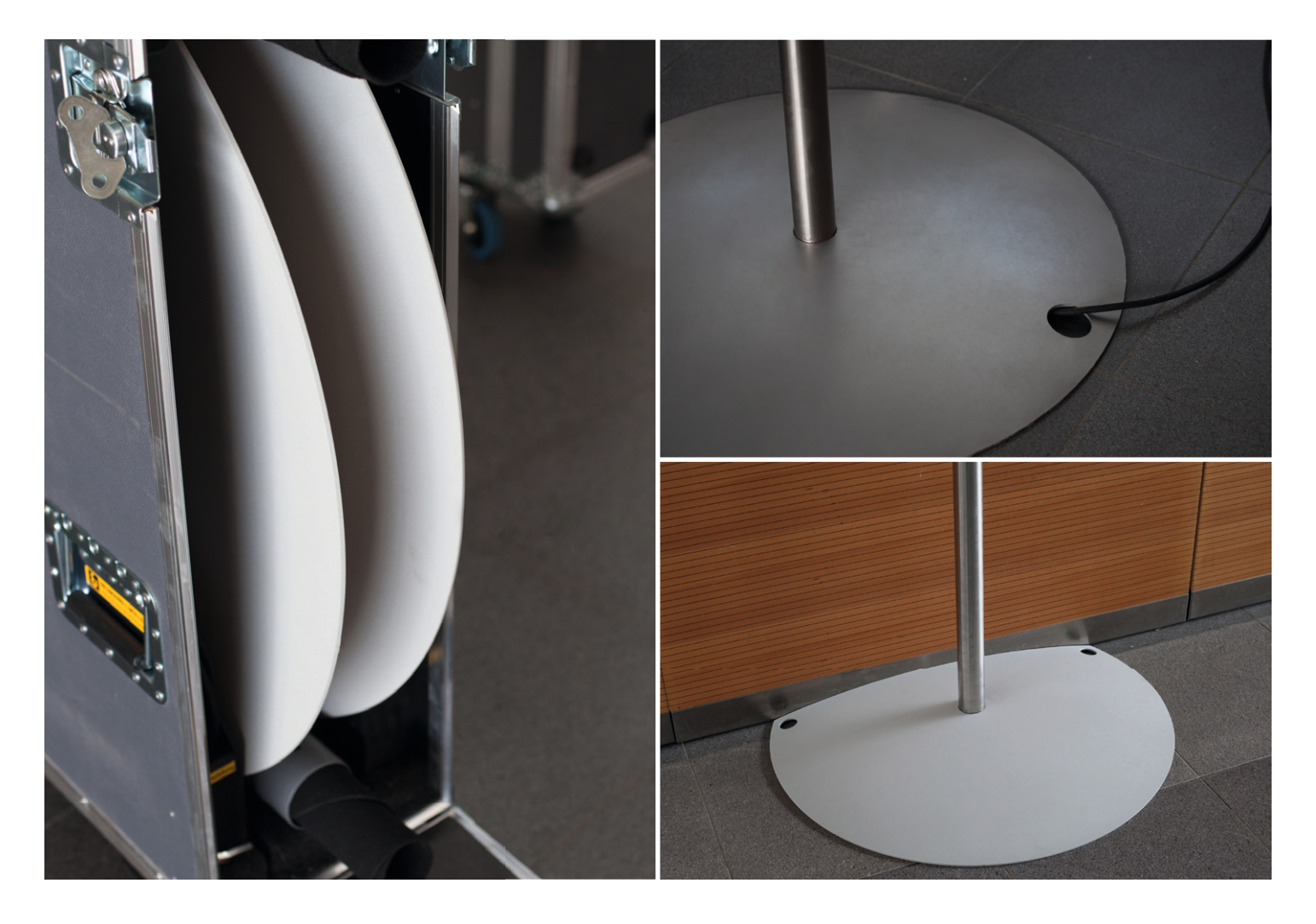
Bespoke cases ensure safe transport